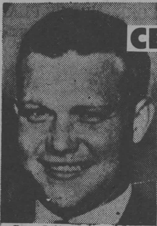
Gov. John B. Swainson

The Knights of Nigeria is sponsoring a Teen Hop and Local Entertainment Show. Saturday July 28, 1962 at the Orchid Gardens, 5028 Joy Road.. Time: 8:00 P.M. to 1:30 A.M.... 16 & up - Donation 25¢