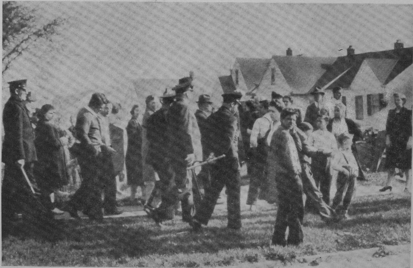
POLICE DISPERSE PICKETS: Detroit officers broke up a white picket line as 14 Negro families moved into the Sojourner Truth Federal housing project in Detroit yesterday. Police guarded Negroes as they moved in. It will take two weeks for all the families to move in

This is the third day in a row we have cut down on the "Daily Picture Magazine" to give more space to exposing how Hearst and the Daily News are playing the game of the Fascist propagandists. We've tried to give you the cream of the pictures briefly each day—but those exclusive pictures which you have been missing are piling up for tomorrow and next week's printing. —Eds.