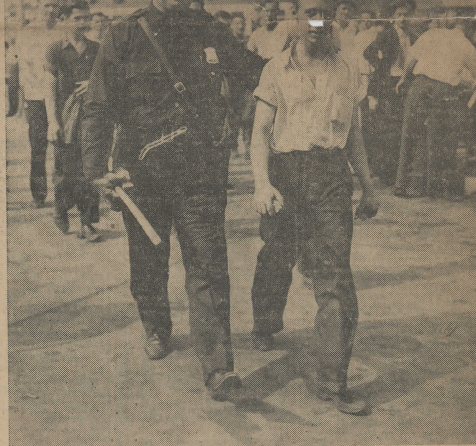
Officer seizes youth with hands full of stones at Woodward and Peterboro.