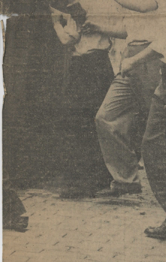
ns, armed with bottles, are close behind.