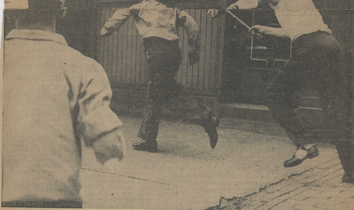
White youth armed with a piece of lead pipe hotly pursues a Negro on Brady, east of Woodward. The pursuer's companions