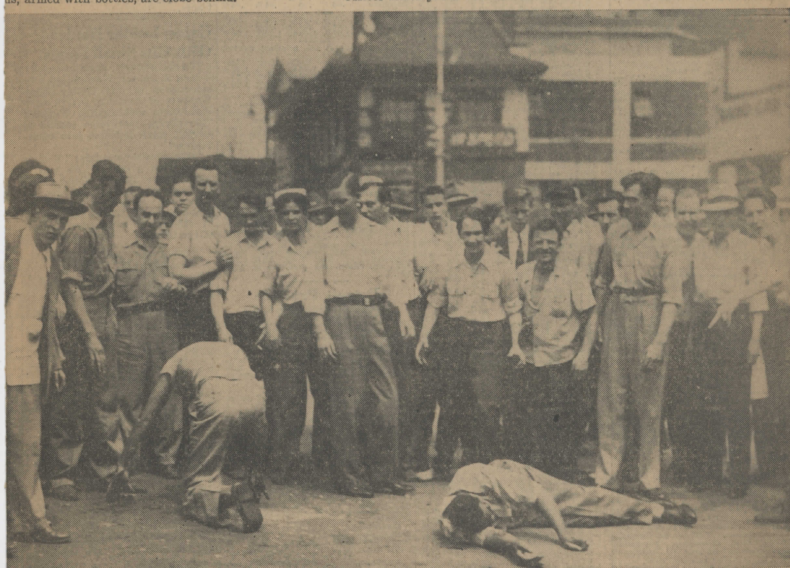
wo Negroes they have knocked down in front of a gasoline station at Woodward and Peterboro. One victim is unconscious.