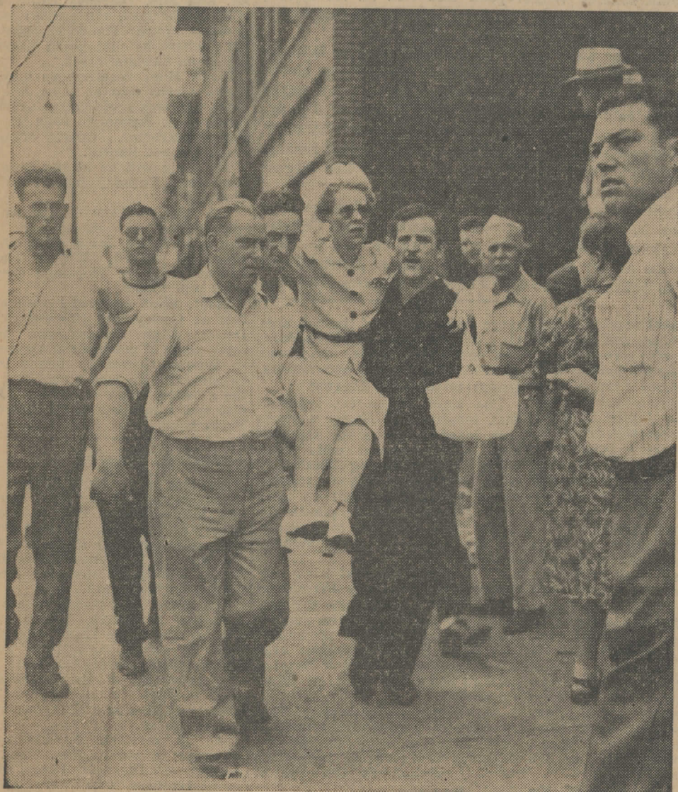
Unidentified woman injured at Woodward and Peterboro is carried to safety.